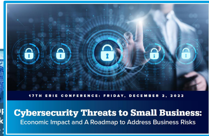
Cybersecurity Threats to Small Business: Economic Impact and A Roadmap to Address Business Risks 17th ERIE Conference: Friday, December 2, 2022