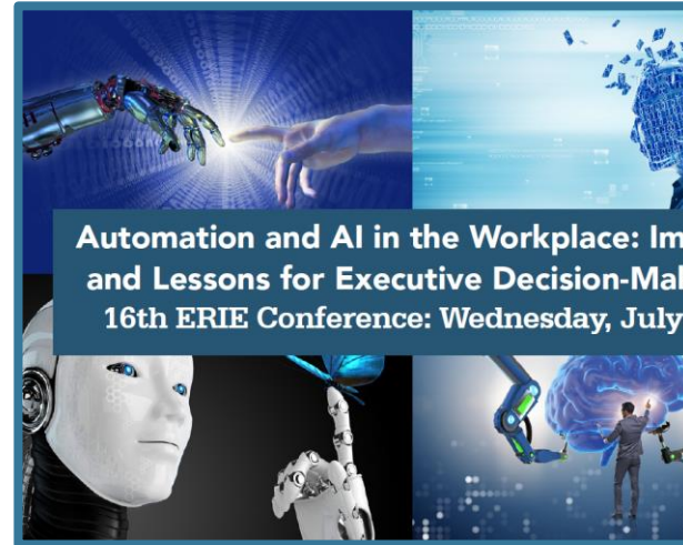
Automation and AI in the Workplace: Implications and Lessons for Executive Decision-Makers 16th ERIE Conference: Wednesday, July 10, 2022